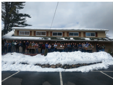
Journalism Students enjoy Andre’s Lakeside Dining