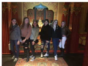
Art Students enjoy a trip to the Newark Museum on 3/23