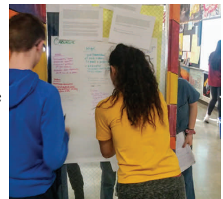
AP Lang students chart their rhetorical analysis of Carnegie's The Gospel of Wealth."

evening was dedicated to honoring the Class of 2018 and a fun time was had by all. Great job Student Council! And the Drama Club is getting excited for their annual trip to New York City to take in a Broadway show. This year they will be seeing Wicked.