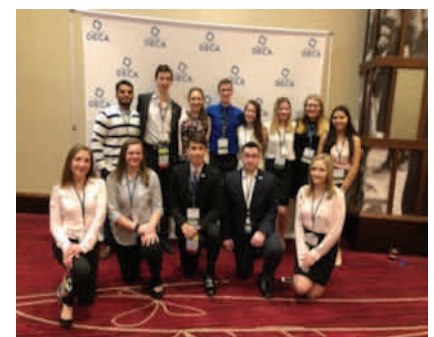
DECA students attended the State Competition from 2/27-3/1.